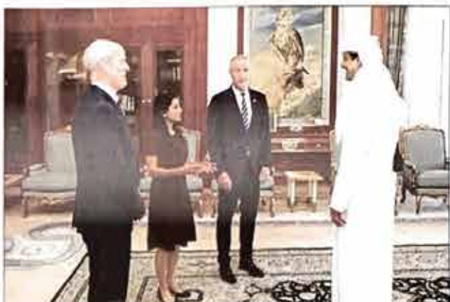
His Highness the Amir Sheikh Tamim bin Hamad al-Thani met yesterday with the visiting US Congress delegation which included representative Sean Patrick Maloney from New York, Rick Larsen from Washington and representative Nanette Barragan from California, who are all members of the Democratic Party. The meeting at the Amiri Diwan reviewed strategic relations of friendship and co-operation between Qatar and the United States and ways to support and strengthen them in various fields, especially in politics, economy, defence, health and education. They also exchanged views on regional and international developments. Page 2