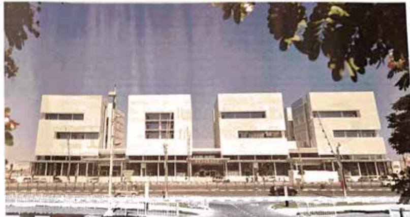
The 2022 building in Aspire Zone. It is world's the first building designed in the form of 2022.