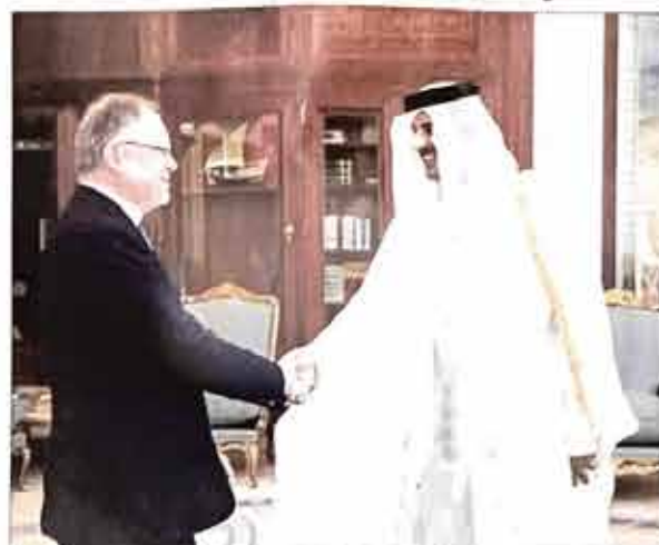
His Highness the Amir Sheikh Tamim bin Hamad al-Thani met yesterday with the visiting Prime Minister of the Federal State of Lower Saxony in Germany, Stephan Weil, and his accompanying delegation. During the meeting at the Amiri Diwan, they reviewed co-operation relations between Qatar and Germany and ways to develop them, especially in energy, trade, industry and investments. Page 2