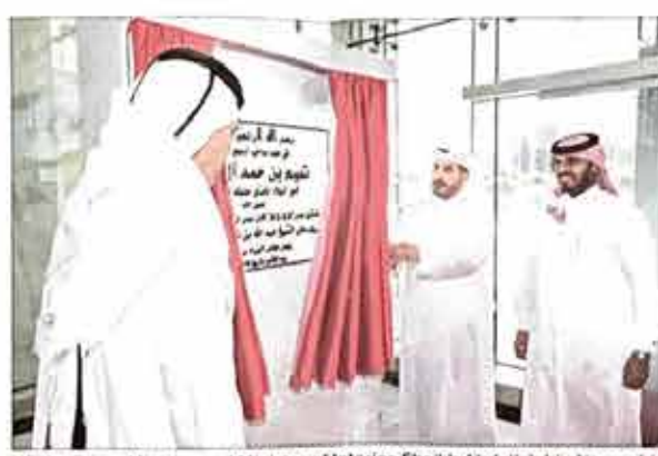
HE the Prime Minister and Minister of Interior, Sheikh Abdullah bin Nasser bin Khalifa al-Thani, unveils the plaque of the 2022 building in Aspire Zone.