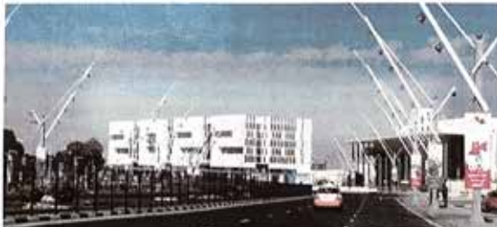
The 2022 building in Aspire Zone...an iconic structure.