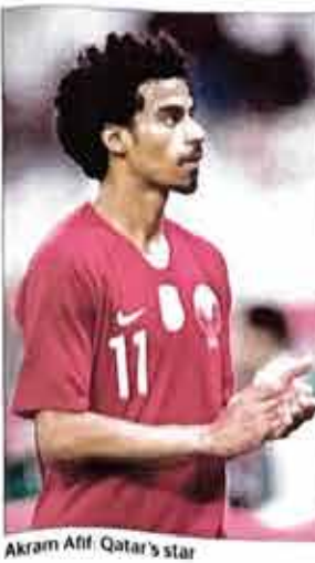
Akram Afif, Qatar's star

A kram Afif's sterling year was made even more exceptional when the Qatar international was named the AFC Player of the Year 2019 at the AFC Annual Awards yesterday. Afif was tipped as a future star since his early years that saw him play for Spanish youth teams Sevilla and Villarreal, before being called up for Qatar's team for the 2012 AFC U-10 Championship Qualifiers and the 2014 AFC U-19 Championship. Not yet 20, Afif was part of Qatar's 2016 AFC U-23 Championship campaign that was led by head coach Felix Sanchez and the forward was again part of the squad in the following edition, where Qatar finished third. A permanent member of the senior national team since 2015, Afif was instrumental in Qatar's AFC Asian Cup