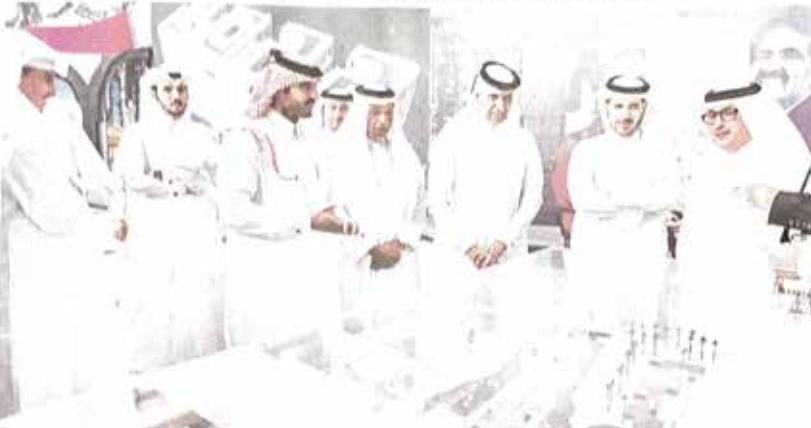
HE the Prime Minister and Minister of Interior Sheikh Abdullah bin Nasser bin Khalifa al-Thani, yesterday inaugurated the 2022 building in Aspire Zone. The prime minister was briefed on the design of the 2022 building.