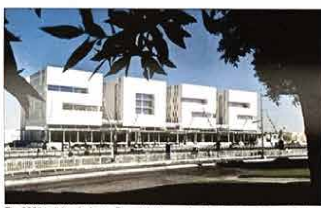
The 2022 building in Aspire Zone. It is the world's first building designed in the form of 2022.

H E the Prime Minister and Minister of Interior, Sheikh Abdullah bin Nasser bin Khalifa al-Thani, yesterday inaugurated the 2022 building in Aspire Zone. After a short film was screened about the development of sports and sports facilities in Qatar, HE the prime minister was briefed on the connotations of the design of the building and its sections. It is world's the first building designed in the form of 2022. The inauguration coincides with the ninth anniversary of Qatar winning the right to host the FIFA World Cup for the first time in the Middle East region. The inauguration was attended by a number of Sheikhs and sports officials.